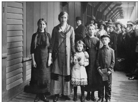
Immigrants Coming to America