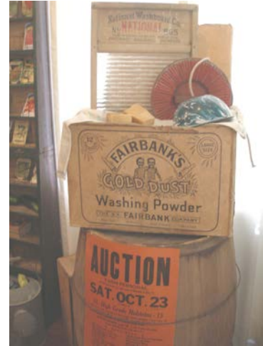
Fairbanks Washing Powder

The Gold Dust Twins trademark for Fairbank's Gold Dust Washing Powder (an all-purpose cleaning agent first introduced in the late 1880s) appeared in printed media as early as 1892. "Goldie" and "Dusty," the original Gold Dust twins, were often shown doing household chores together. In general use since, the term has had popular use as a nickname on several occasions. It is often used to describe two talented individuals working closely together for a common goal, especially in sports.