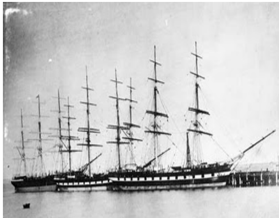
Irish Sailing ship

Don’t miss this exhibit! It will only be available for viewing at this year’s Thresheree held on September 17 th and 18 th , from 9:00 a.m. until 5:00 p.m. each day at the Richfield Historical Park. More details on the Thresheree are in the attached flier or go to richfieldhistoricalsociety.org . We hope to see you there.